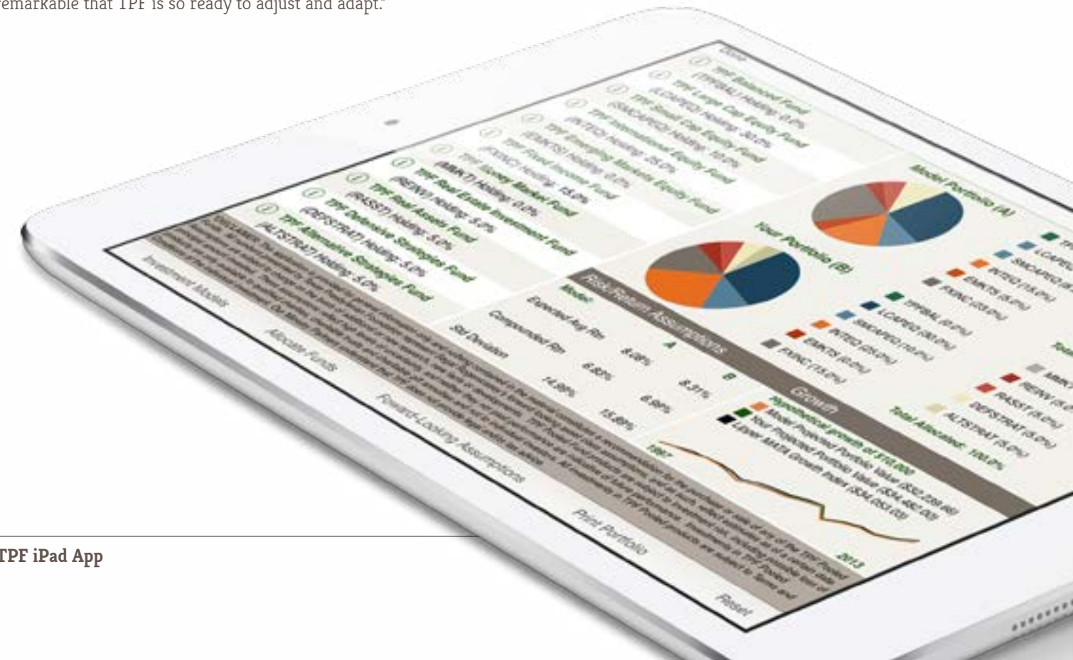
TPF iPad App